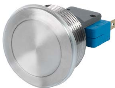
MSM switch is not part of the product