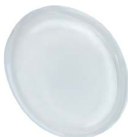
Protection cover for MSM 19 and MSM 22