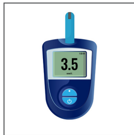
Compact medical applications