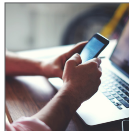
Compact consumer applications