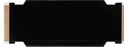
.5mm gold plated, notched FFC with black PET jacket