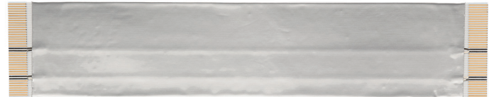
0.5mm gold plated, foil shielded FFC with conductors grounded to shield