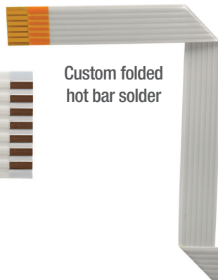
Custom folded hot bar solder