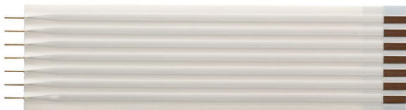
2.54mm RFC Polyester insulation - Hybrid - Type B