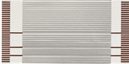
1mm tin plated, foil shielded FFC with conductors grounded to shield