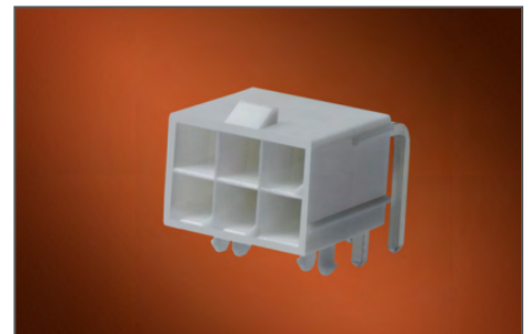
Mini-Fit® Plus Header