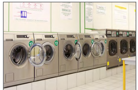
Laundry Equipment (washers and dryers)