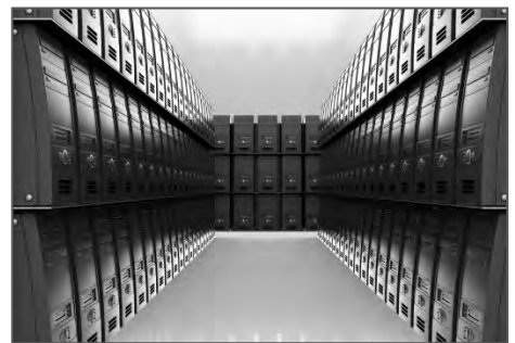
Server and Storage Room