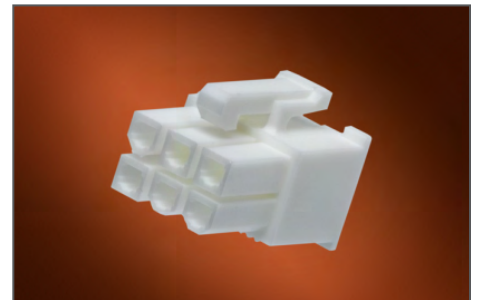
Mini-Fit® Plus Receptacle