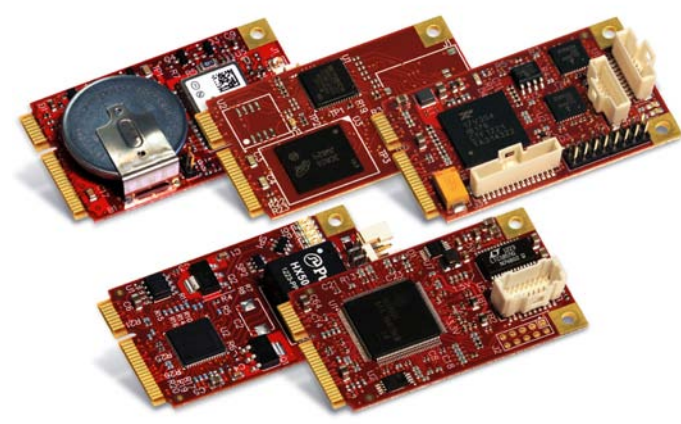
Mini PCle Modules