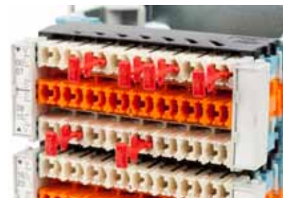
3M™ Disconnection Plug SOR FC on the 3M™ Integrated Splitter Block BRCP-SP