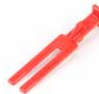
3M™ Disconnection Plug SOR FC