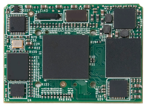
OMAP-L138 SOM-M1 *Enlarged to show detail

For medical, industrial, audio, and communication products, the OMAP-L138 SOM-M1 allows for powerful versatility, long-life, and greener products.