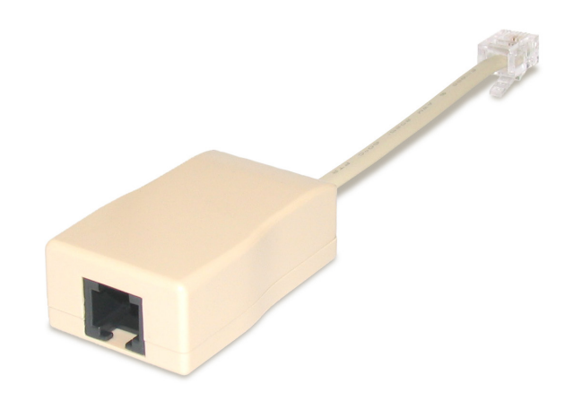
Z-230PJ In-Line xDSL over POTS Filter

The Z-230PJ is a small in-line filter designed to expedite the service delivery and improve the performance of digital subscriber line (DSL) and home phoneline network (HPN) services. This model filters all telephone sets, facsimile machines, answering machines, etc individually or in groups on line 1 only. Our in-line DSL filter design electronically isolates the high-speed DSL and HPN data streams from the voice band plain old telephone service (POTS). This design effectively blocks the DSL, and HPN up to 30 Megahertz.