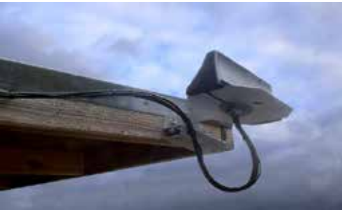
Multiband antenna (Razorback) on wall mount