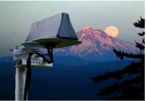
Multiband Antennas (Razorback) on Pipe Mount