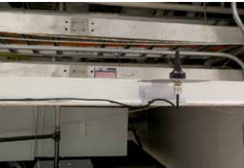
SLPT antenna mounted on I-Beam