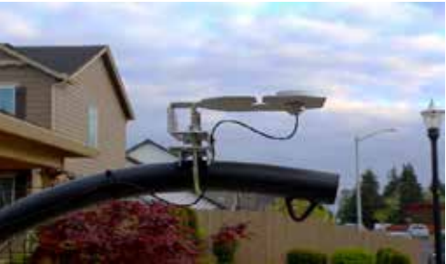
GPS Antenna on horizontal pipe mount