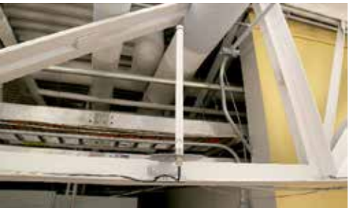
Radome Omni antenna mounted on I-Beam