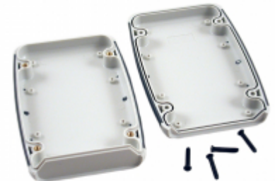
Key Internal Features